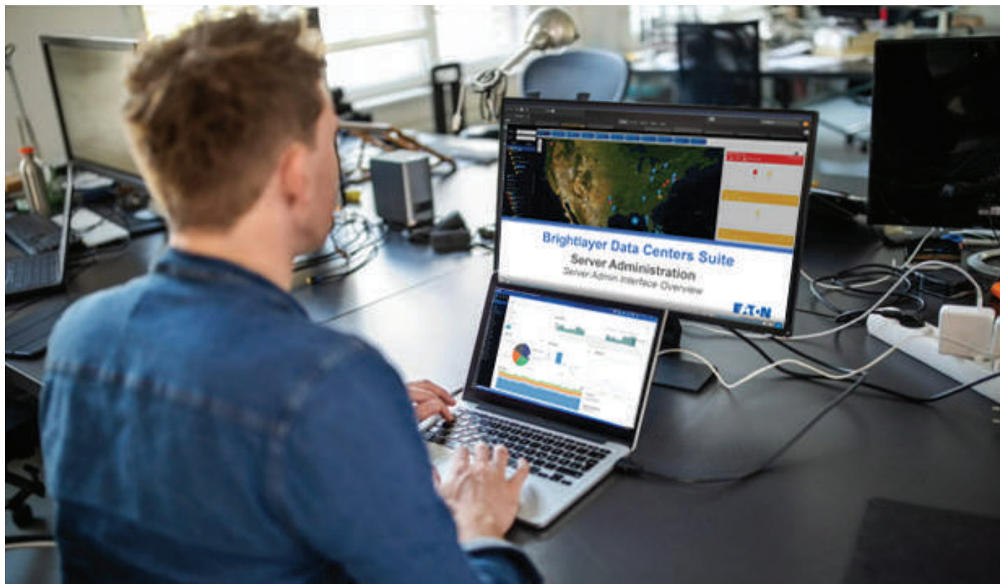
Map and distributed alarming report provides visibility into what's happening across your sites.