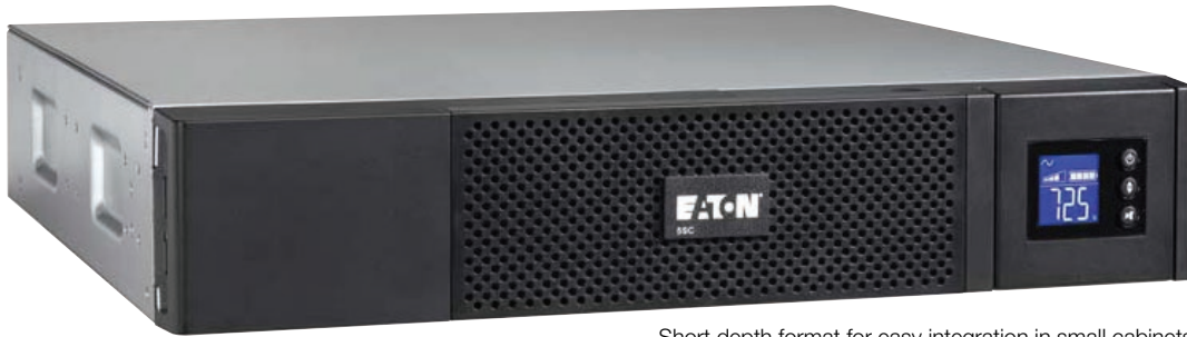
Short depth format for easy integration in small cabinets